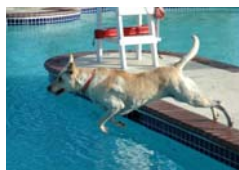
Yippee! This is fun!