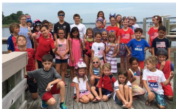
4th of July Celebration